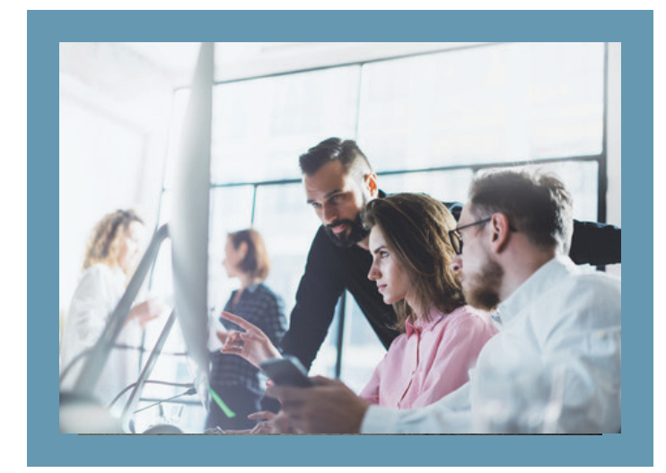
The Top Three Motivators for a Production Manager are:

Workplace motivators make up the next critical success factor needed, which tells us why an individual will do the job or, in other words, what rewards and cultures are they seeking on the job.